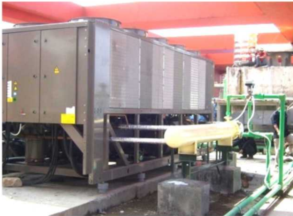
Heat recovery from refrigerant hot gas to water . Max. temperature of water can be reach = 70 °C

The refrigeration cycle of an air conditioner or chiller provides an opportunity to recover heat for water heating. Compressors concentrate heat by compressing gaseous refrigerant. The resultant superheated gas is normally pumped to condenser for heat rejection. However, a hot gas to water heat exchanger may be placed into the refrigerant line between the compressor and condenser coil to capture a portion of the rejected heat.