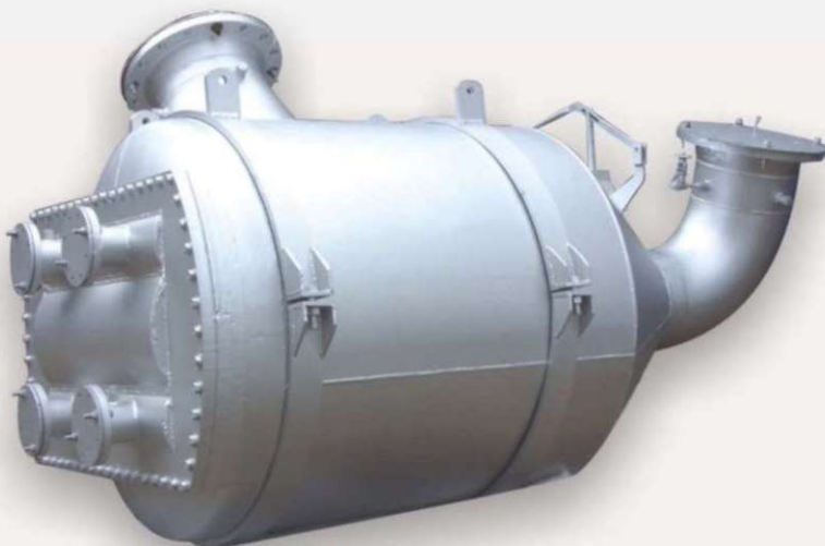
Gas Inter Cooler