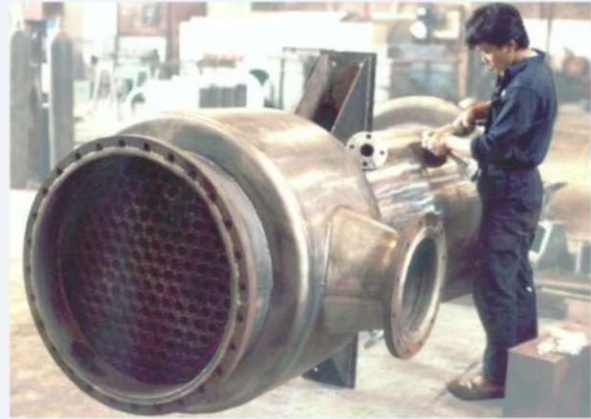
Citric Acid Cooler