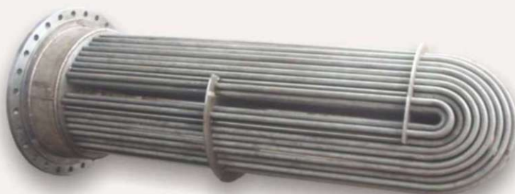
U Tube Bundle