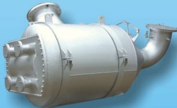
Gas Inter Cooler