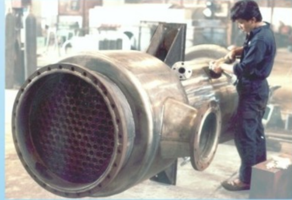
Citric Acid Cooler