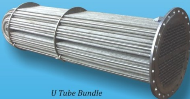
U Tube Bundle