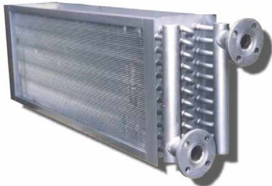
Heating Coil ( Hot Water to Air )