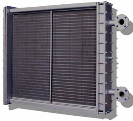
Cooling Coil ( Water to Compress Air )