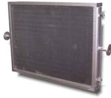
Heating Coil with Tube Sheet