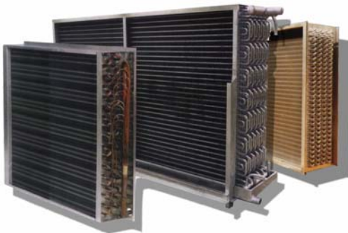
HVAC Cooling / Heating Coil